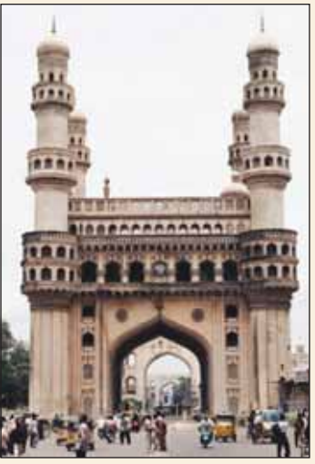
Charminar, the icon of Hyderabad

Hyderabad is known for its rich history, culture and architecture - its multilingual